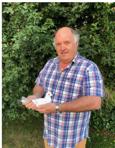
EERSTE PROVINCIAL JONGE DUIVEN