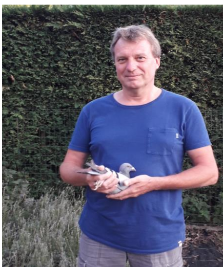
EERSTE PROVINCIAL OUDE DUIVEN