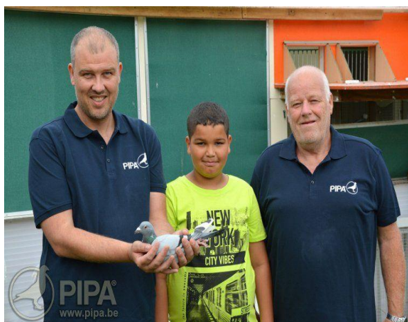
EERSTE PROVINCIAL JAARSE DUIVEN